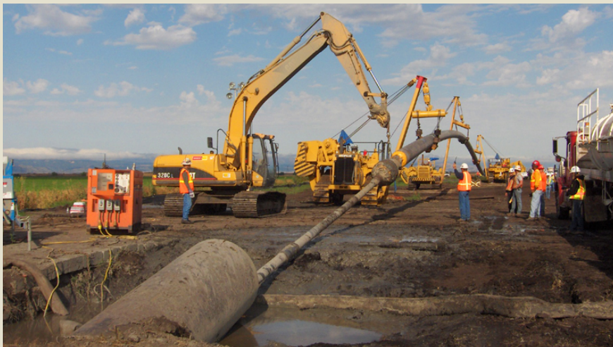
Installing new pipe into a horizontal directional drilled pilot channel

The pipeline industry is currently updating its industry-wide recommended practice for water crossings API RP 1133 to include the latest best practices from operators at the forefront of this issue. Executives of the pipeline members of the American Petroleum Institute and the Association of Oil Pipe Lines recently designated as a Strategic Initiative updating industry-wide guidance for water crossings, ensuring it receives the necessary support and resources for an expedited completion. The updated document will include extensive new guidance on surveying, monitoring and protecting water crossings.